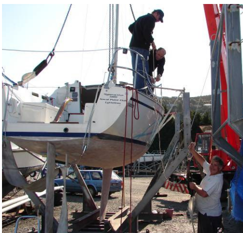
A fine day yesterday presented the opportunity to weigh a couple more keelboats for IRC